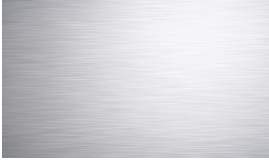
BRUSHED STAINLESS STEEL SATİNE PASLANMAZ ÇELİK