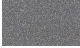
METALLIC GREY METALİK GRİ